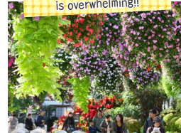
Flowers of greenhouse is overwhelming!!

Various birds (e.g. owls, Harris Hawk, etc.) will perform.