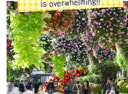
Flowers of greenhouse is overwhelming!!

Various birds (e.g. owls, Harris Hawk, etc.) will perform.