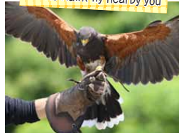
Harris Hawk fly nearby you

For example, you can take a photo and capture your memories of putting an owl on your arm, hugging a penguins, and etc.