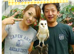
Together with Barn Owl

With feeding experience, you can watch birds eating from your own hands from up close.